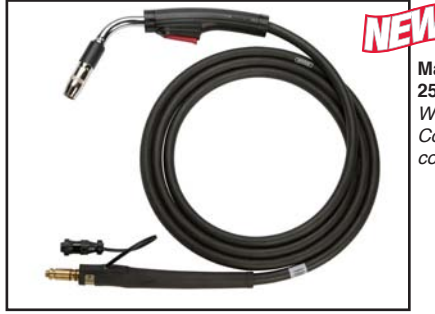
Magnum PRO 250L Gun With long lasting Copper Plus contact tips

Adds 4-step trigger interlock, spot mode, adjustable run-in speed for smoother arc starting, and adjustable burnback time to minimize wire sticking in puddle.