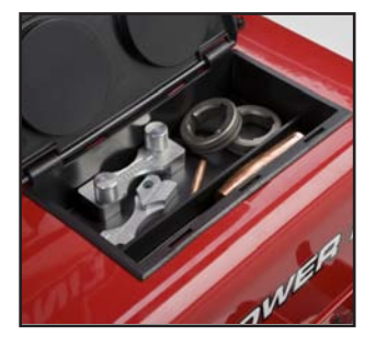
Gun Expendable Parts Compartment